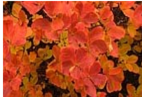
Rh. schlippenbachii fall colour