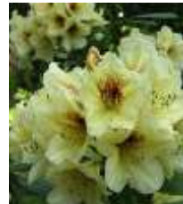
Holden's Solar Flair