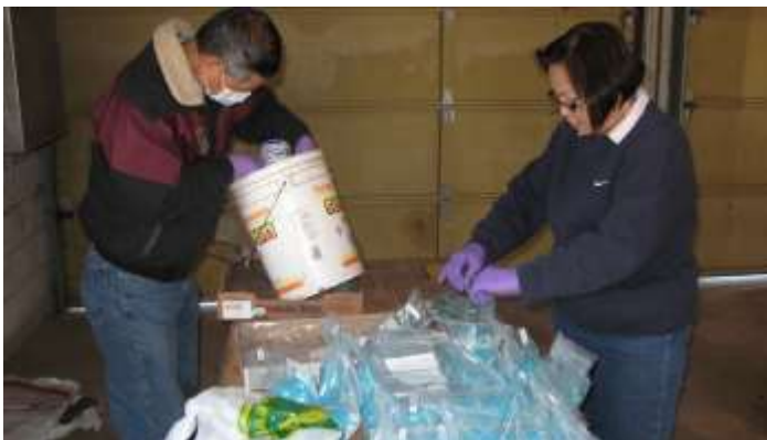
Preparing the fertilizer packets

This month we close out the Spring and Summer season and start the Fall program, but first a brief reference to how the spring season ended. Member and volunteer support is critical to the continuing success of any community Not-for-Profit organization. Our members and volunteers