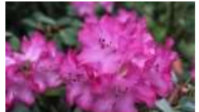
Tantramar Truss (Brueckner)