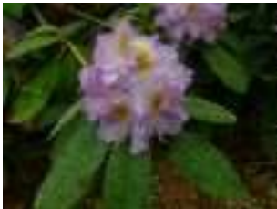
V60009 (Al Smith)