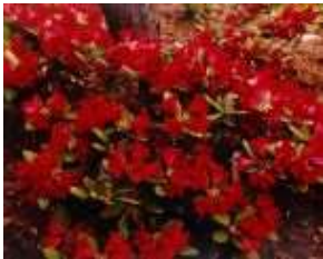
Lionel's Red Shield