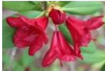
Lionel's Red Shield (Florets)