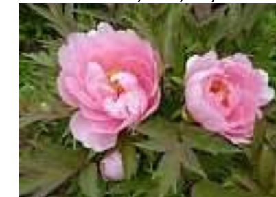
Peony Suffruticosa HANAKISOI