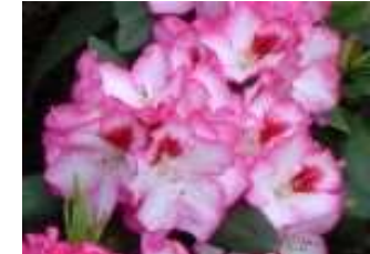
Elepidote Hachman's Charmant