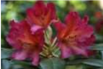
Elepidote Golden Gate