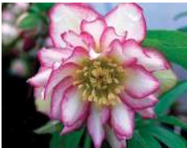
Helleborus Rose Quartz