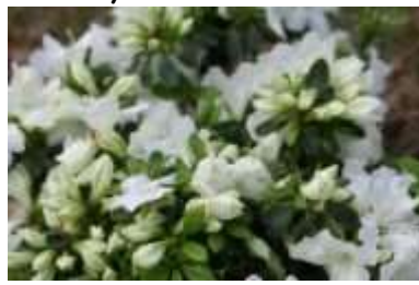
EG Girard's pleasant White