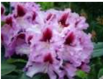
Elepidote Hachman's Kabarett