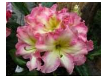
Elepidote Melrose Flash