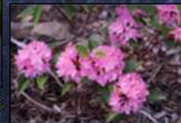
Rhododendron minus Alabama populations

Eastern/Southeastern US plant exploration