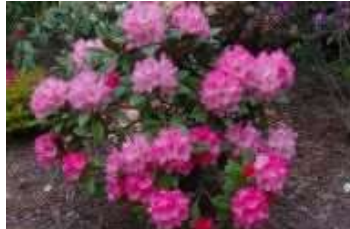
Elepidote Hachman's Belona