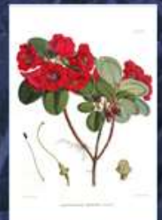
The Rhododendrons of Sikkim-Himalaya (1849-51) Joseph Dalton Hooker