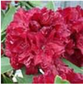
Elepidote Double Bess