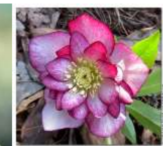
Helleborus Peppermint Ice