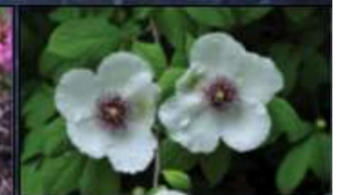
Stewartia malacodendron silky camellia