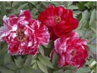
Peony Suffruticosa Shimamishiki