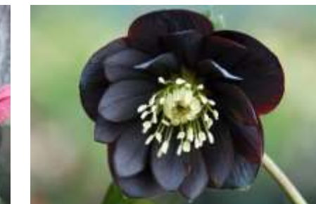
Helleborus Onyx Odyssey