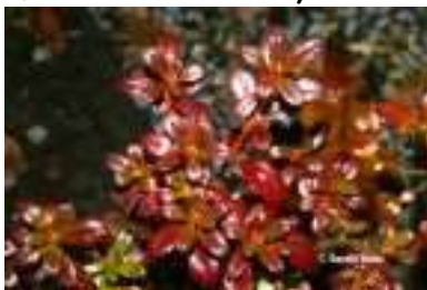
EG Cherry Drops Fall Colour