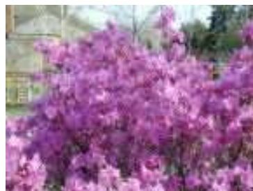
Lep Cornell Pink