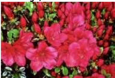
EG Cherry Drops