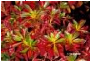
EG Herbert Fall Colour