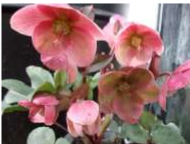
Helleborus Pink Frost