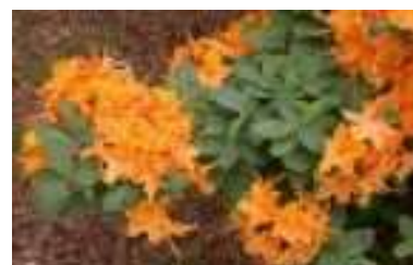
Dec Azalea Baltic Amber