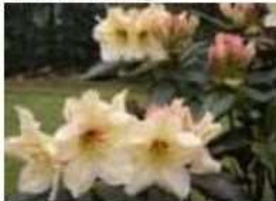
Holden's Solar Flair