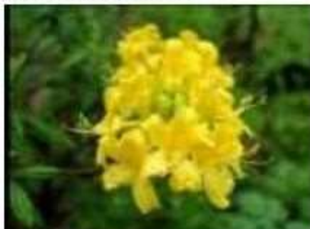
luteum "Golden Comet"