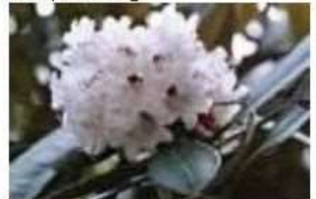
Holden's Spring Herald