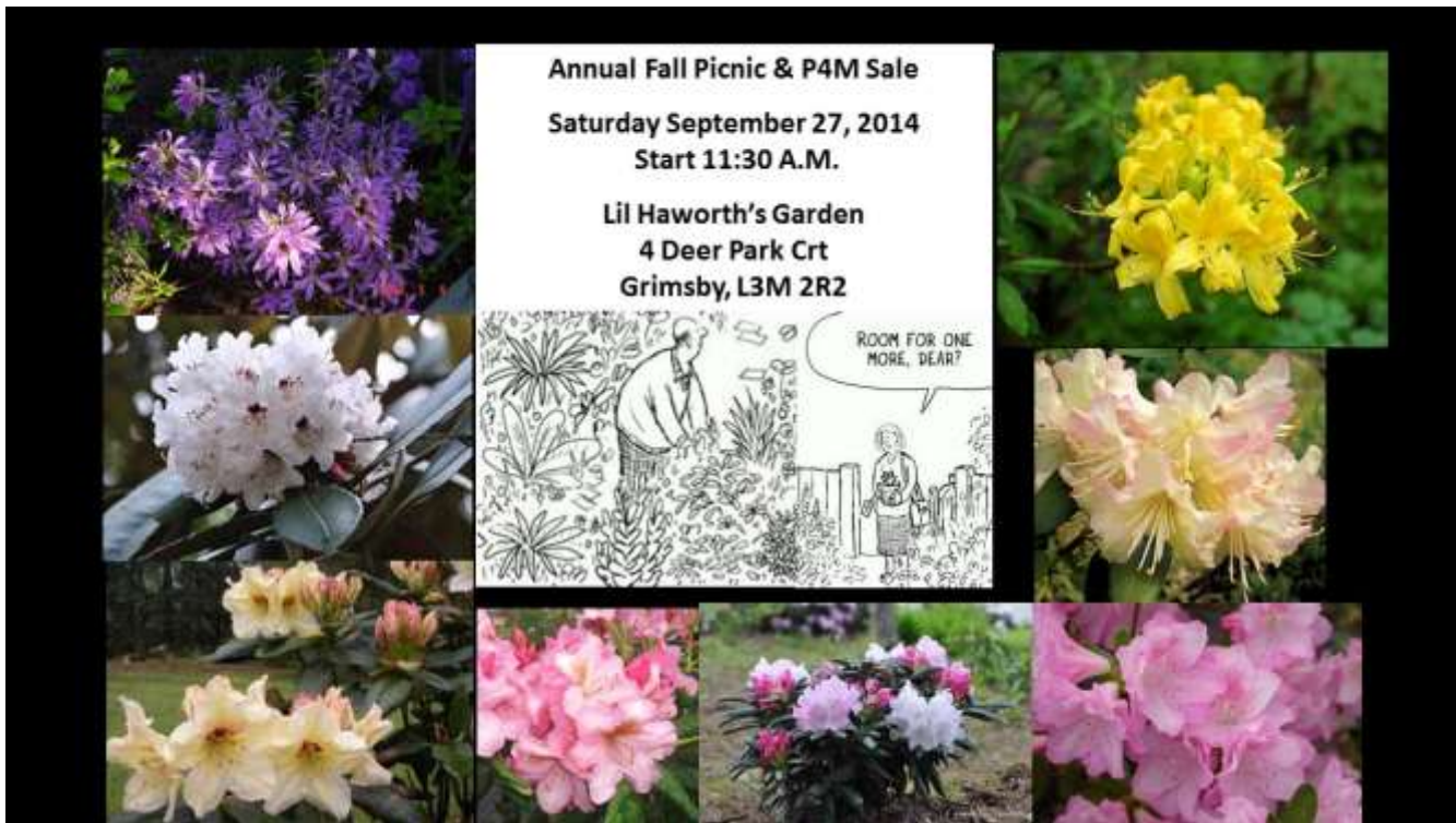
Some of the cultivars to be available at the P4M distribution. In the collage shown below, counterclockwise from top left: Koromo Shikibu , Holden's Spring Herald , Holden's Solar Flair , Vineland Fragrance , Mist Maiden , Al's Picotee , Mary Fleming , Luteum "Golden Comet" .